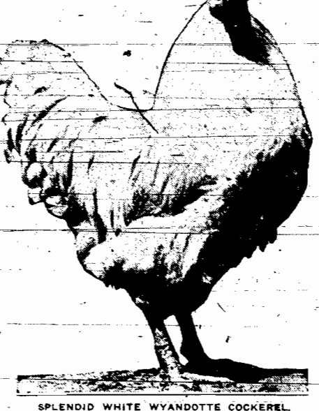
SPLENDID WHITE WYANDOTTE COCKEREL.